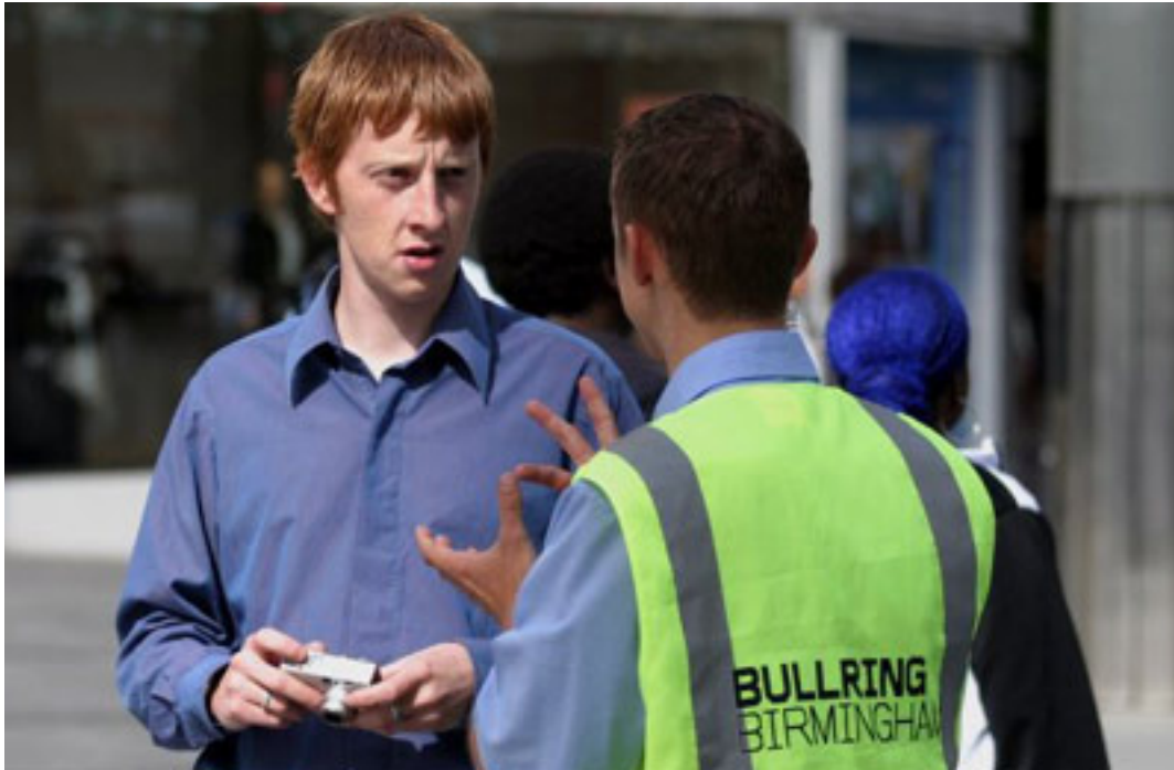
iv. Birmingham Bullring

Endorsing the Fareham shopping centre's position, a centre manager in neighbouring Havant offered his own procedural arrangements to a local newspaper, by way of further explanation: