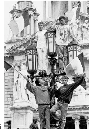
Lee Clegg riots, 1995